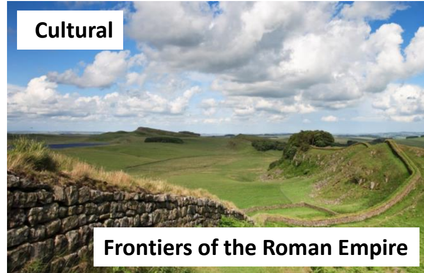
Frontiers of the Roman Empire