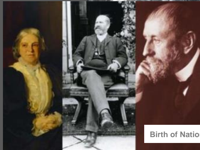
Birth of National Trust