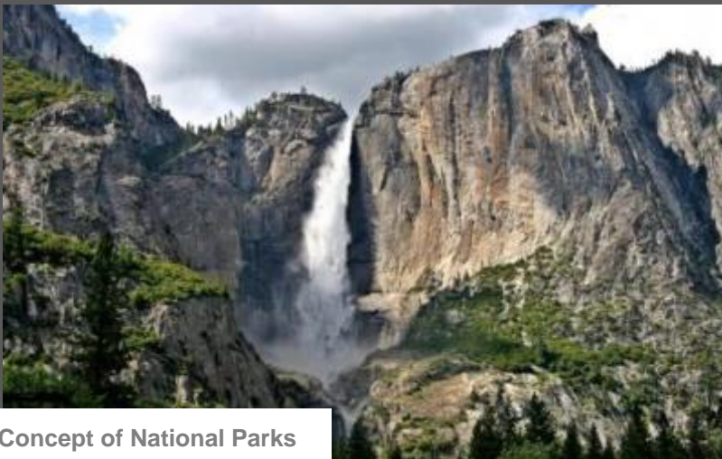
Concept of National Parks