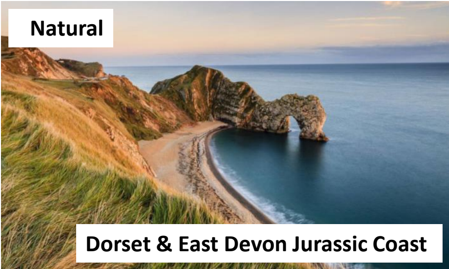
Dorset & East Devon Jurassic Coast