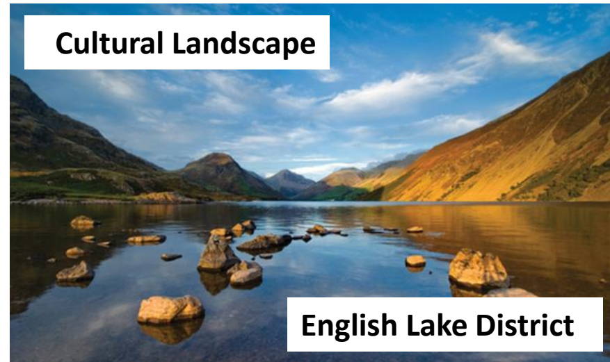
English Lake District